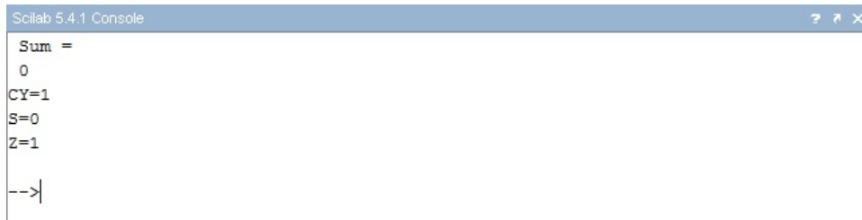
Figure 6.5: INCRIMENTING ACCUMULATOR CONTENT

1 //page no 179 2 //example 6.6 3 //SUBTRACTION OF TWO NUMBERS. 4 //accumulator has 97H. Converting it into decimal value 5 clc; 6 A=hex2dec(['97']); 7 //register B has 65H. Finding 2's compliment of 65H. 8 B=hex2dec(['65']); 9 X=256-B; 10 Y=A+X; 11 S=Y-256; 12 Z=dec2hex(S); 13 printf('Subtraction= ') 14 disp(Z); 15 if Y>255 then 16 CY=1; 17 printf('The result is positive. \n'); 18 else 19 CY=0; 20 printf('The result is negative. \n') 21 end 22 if S>127 then 23 printf('S=1 \n') 24 else 25 printf('S=0 \n') 26 end 27 if S>0 then