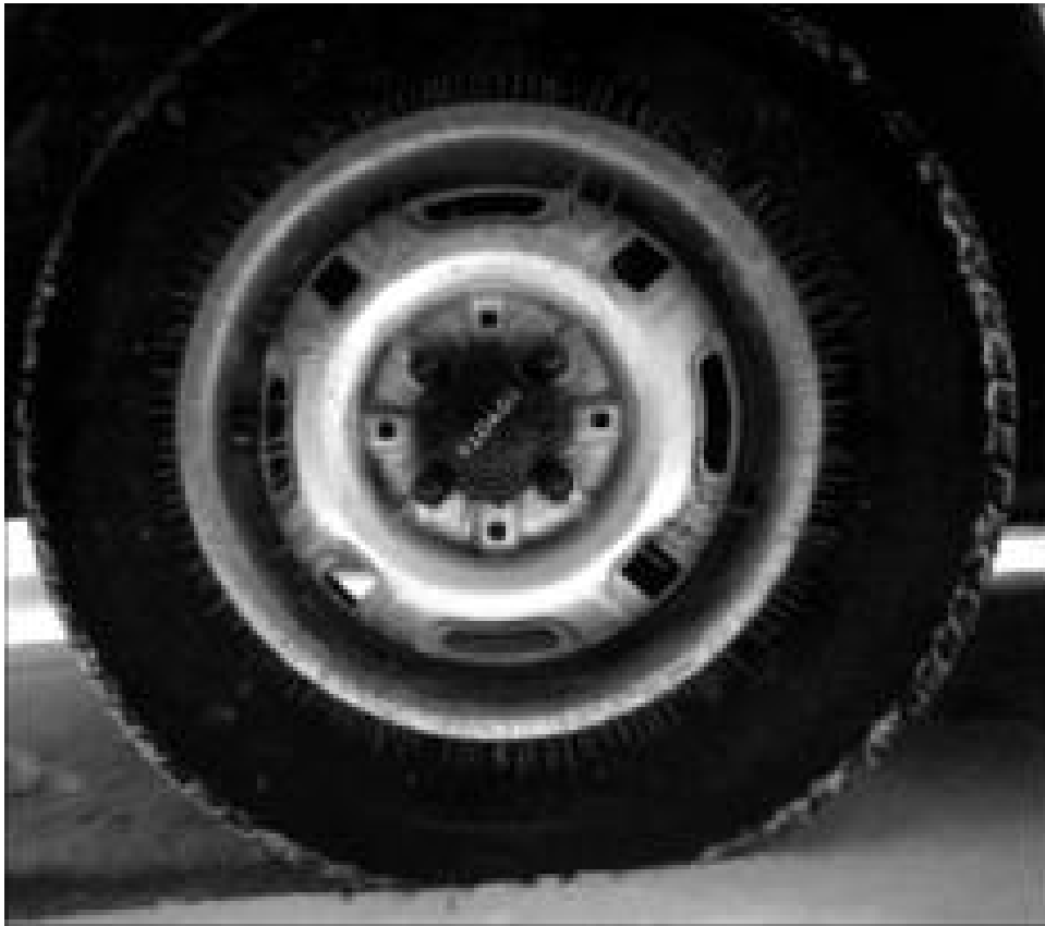
Figure 15.1: Exp15